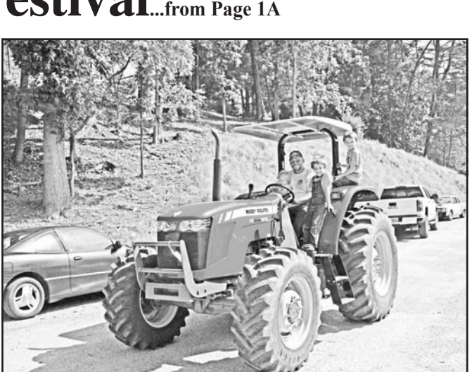
The Tractor Show & Parade is always a great, family-friendly event at the Farmers Market.

And though these are the main public events going on during the weekend, families and friends can still get together